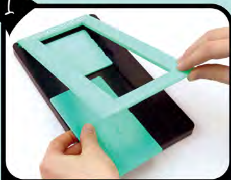
Place plates in the tablet

Choose plates for your fashion design. Lift the frame and place the plates in the tray of the tablet.