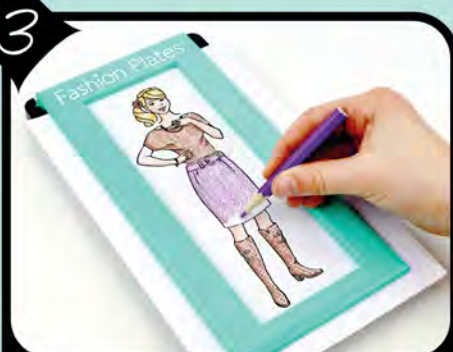
Flip plates to add patterns!

Flip the plates over in the tray and color with colored pencils to add patterns to your fashions.