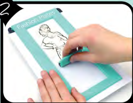
Add paper & rub with crayon

Place a piece of paper on top of the plates and close the frame. Hold the frame in place with one hand and use the rubbing crayon in the crayon holder to rub back and forth over the paper. This creates the outline of your fashion design.